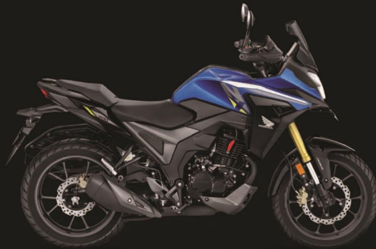
Athletic Blue Metallic