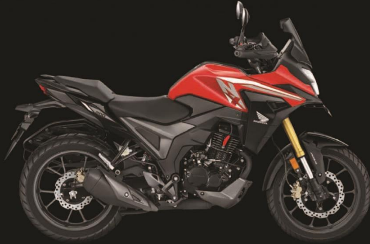
Radiant Red Metallic