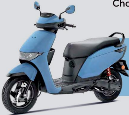
Pearl Serenity Blue

Choose from a range of stunning colours that reflect your personality.