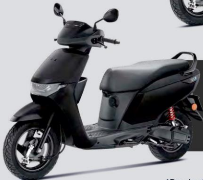
Pearl Igneous Black