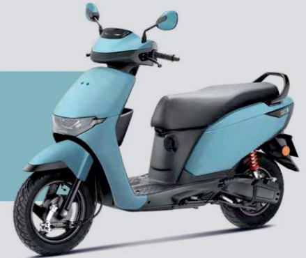
Pearl Shallow Blue