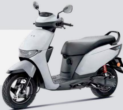
Pearl Misty White