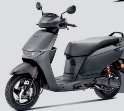
Matt Foggy Silver Metallic

*Products shown in the pictures may vary from actual products available in the market. All features and colours may not be a part of all variants. Accessories shown in the pictures are not a part of standard equipment. For creative visualisation only.