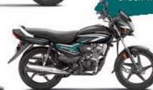
Green with Black