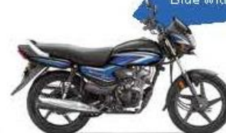
Blue with Black