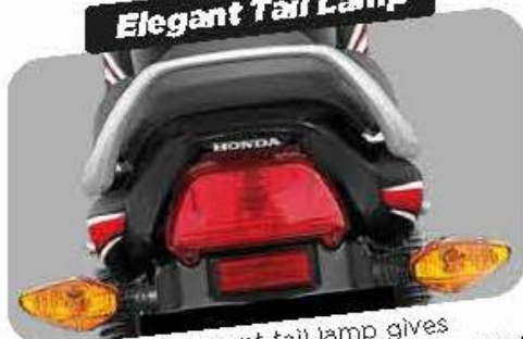
Elegant Tail Lamp

Bright and elegant tail lamp gives the bike an imposing look from the back.