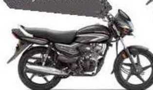
Gray with Black