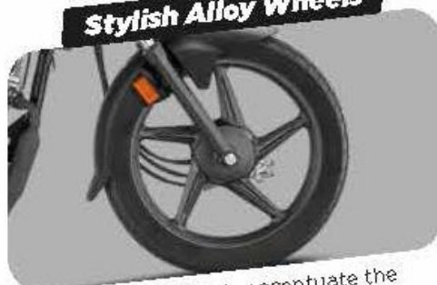
Stylish Alloy Wheels

All-black alloy wheels accentuate the overall look of the bike.