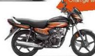
Orange with Black