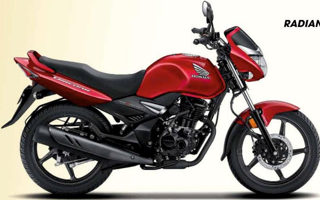
RADIANT RED METALLIC