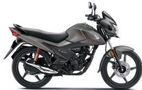
MATT CRUST METALLIC